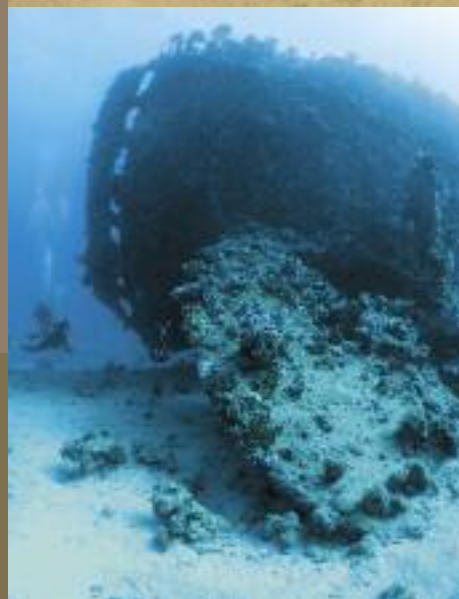
Top: Locomotive tender from the wreck of the Thistlegorm